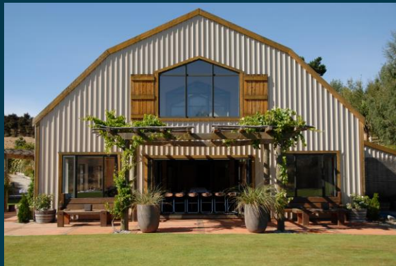
The Lookout Lodge