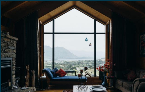
Poppy's Bed & Breakfast