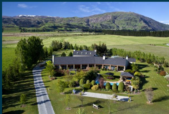
Lime Tree Lodge