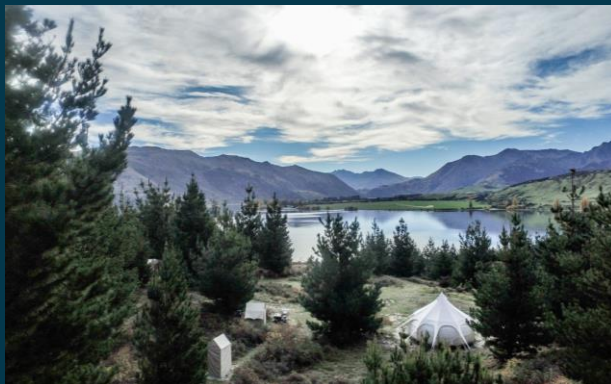
Explore Life Glamping