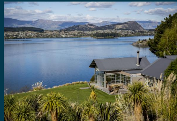
Whare Kea Lodge & Chalet