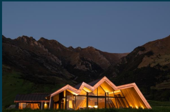
Mt Isthmus Lodge