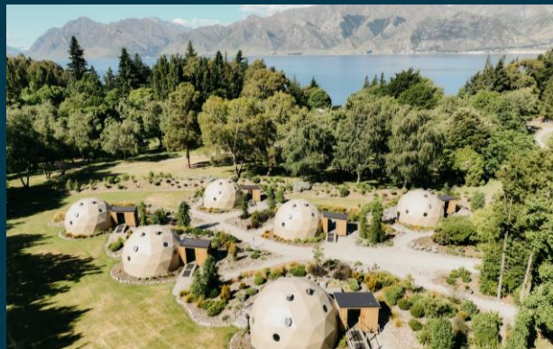
Cross Hill Geo Domes